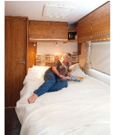
Space under the bed is easily accessed thanks to strong gas struts. Halogen lights and padded headboard add to comfort of bed area