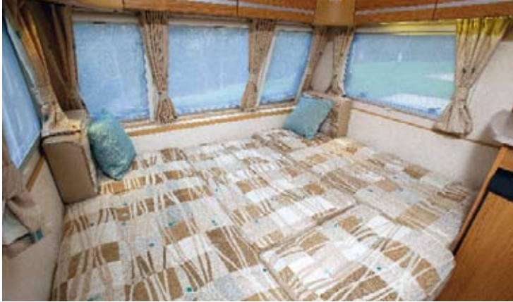
Deep cushions and wall boards make the front bed comfortable

people are buying this van for the fixed bed and that area works very well," says Paul.