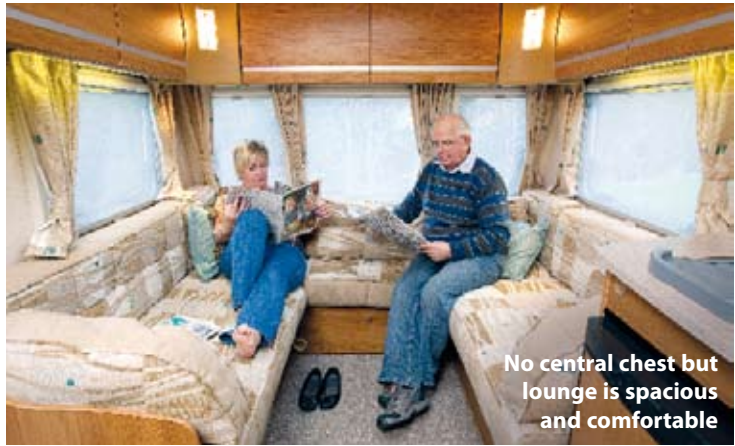
No central chest but lounge is spacious and comfortable