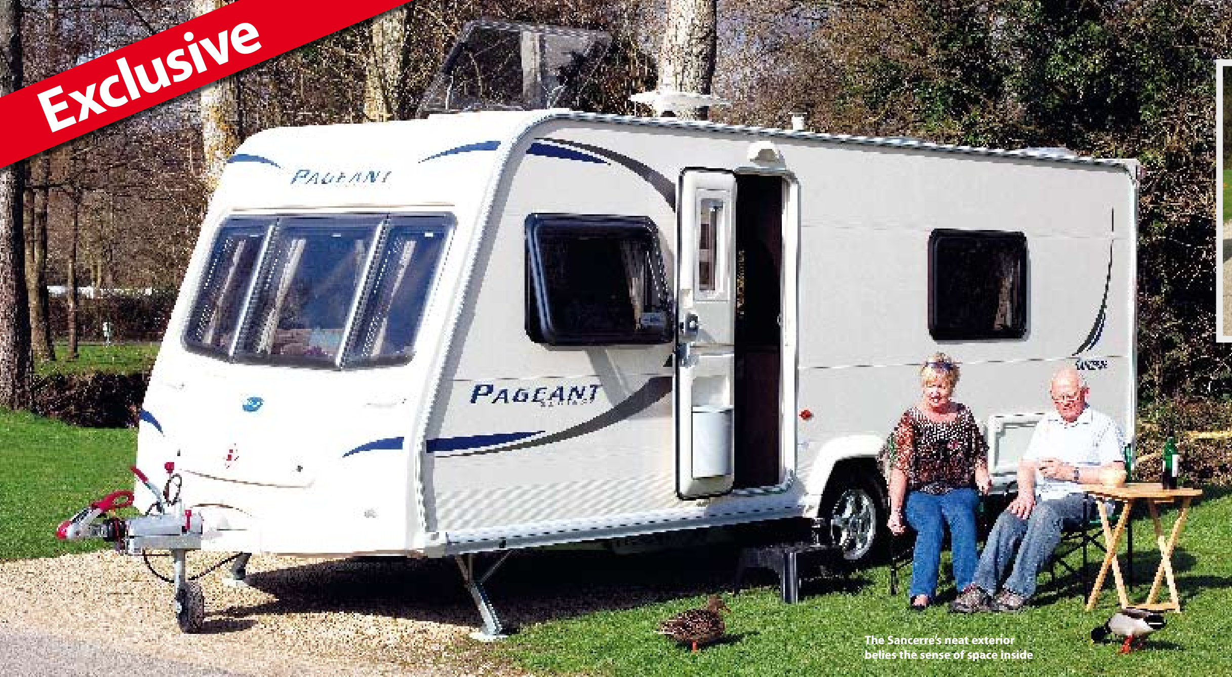
The Sancerre's neat exterior belies the sense of space inside