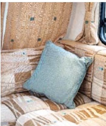
Hilary likes the upholstery. But removing the ice box proves fiddly