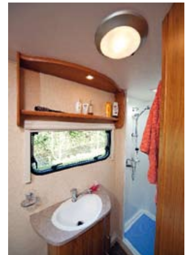
End washroom is well lit with good storage and separate shower