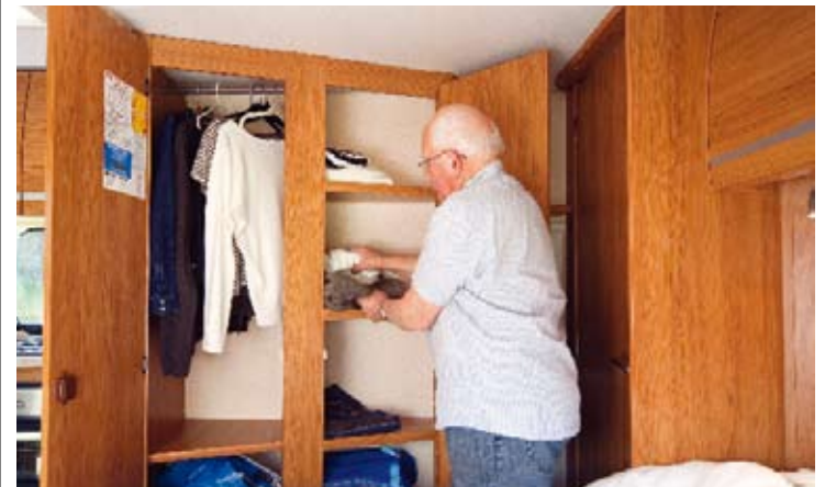
The large wardrobe has plenty of hanging and shelving space