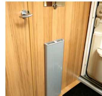
Radiators like this one carry heat from the Alde compact boiler