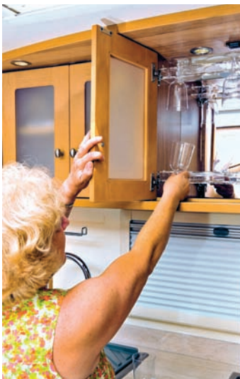
Dedicated drinks cabinet harks back to tourers of the past