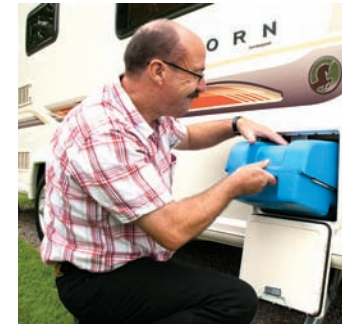
The Unicorn comes with its own water carrier and dedicated locker

"I'm always happy to have the external barbecue point in case I need it," Gary said. "We use an awning, so the external mains socket and LED awning light are fantastic. They'll be great for when I'm painting in the evening."