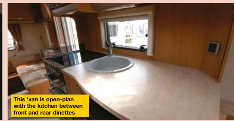
This 'van is open-plan with the kitchen between front and rear dinettes