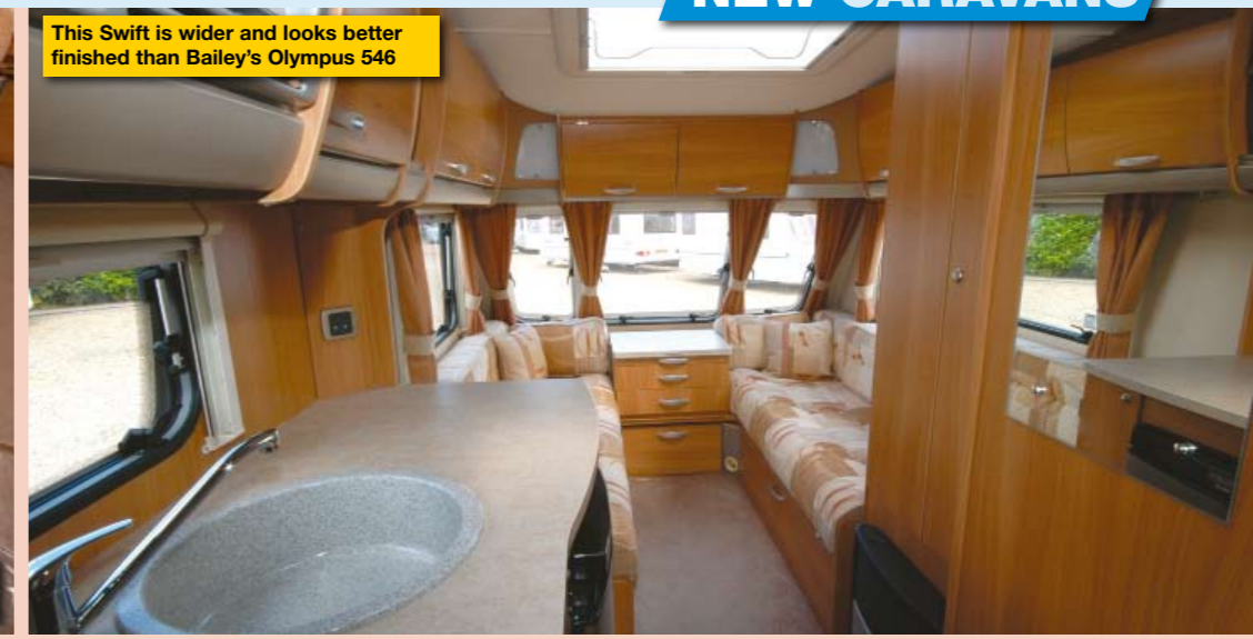
This Swift is wider and looks better finished than Bailey's Olympus 546