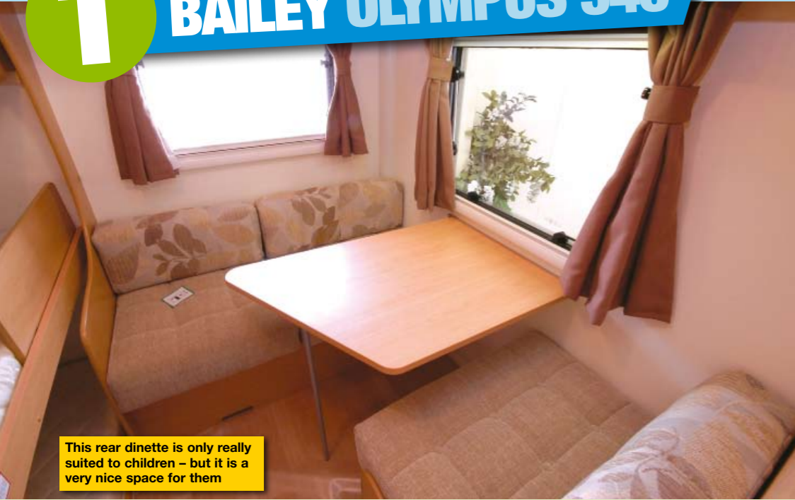
This rear dinette is only really suited to children – but it is a very nice space for them