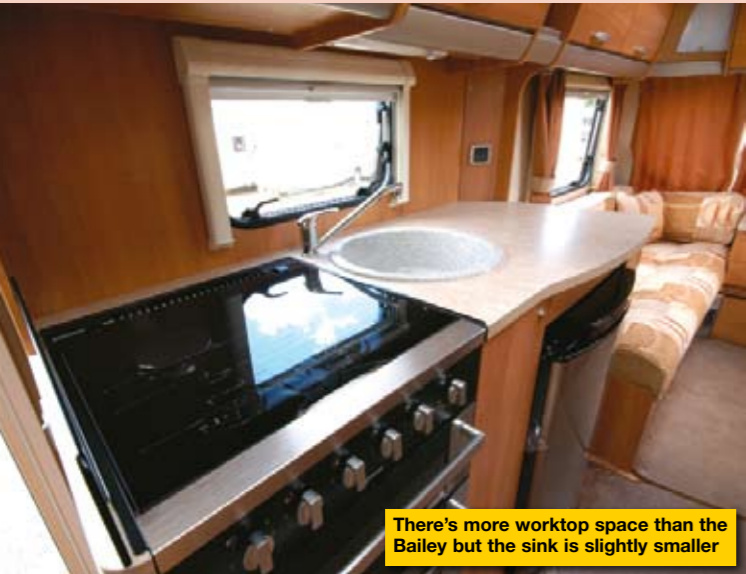
There's more worktop space than the Bailey but the sink is slightly smaller