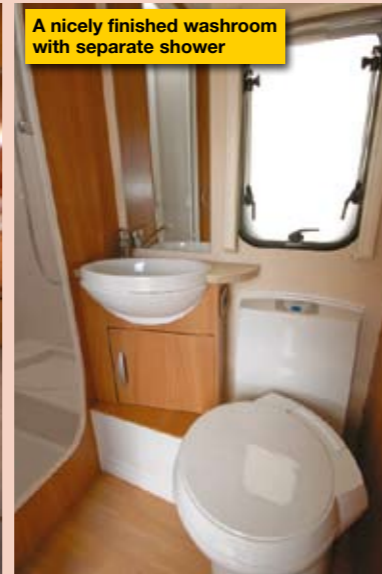
A nicely finished washroom with separate shower