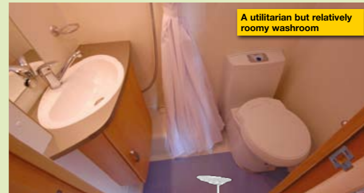
A utilitarian but relatively roomy washroom