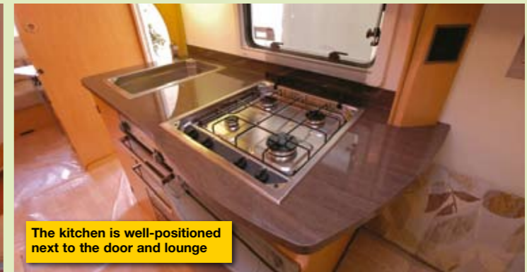
The kitchen is well-positioned next to the door and lounge