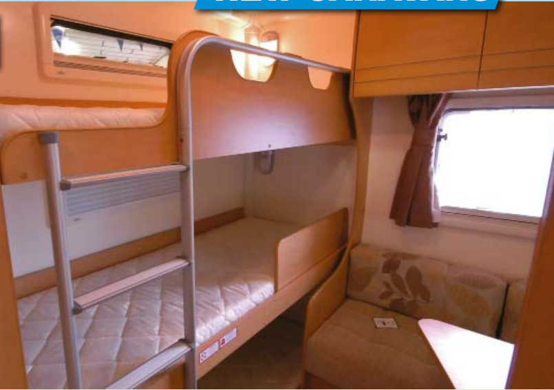
These bunks are great for children and the side panels stop them falling out