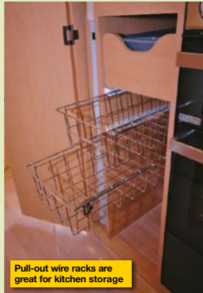
Pull-out wire racks are great for kitchen storage