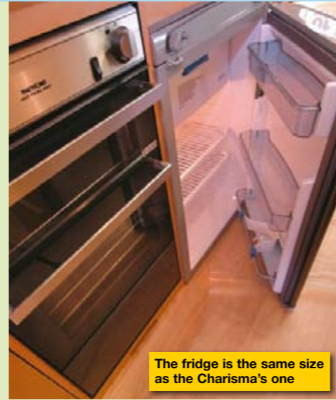
The fridge is the same size as the Charisma's one

I DISLIKE Spartan washroom, handle-less overhead lockers, rather anaemic LED ambient LED lighting