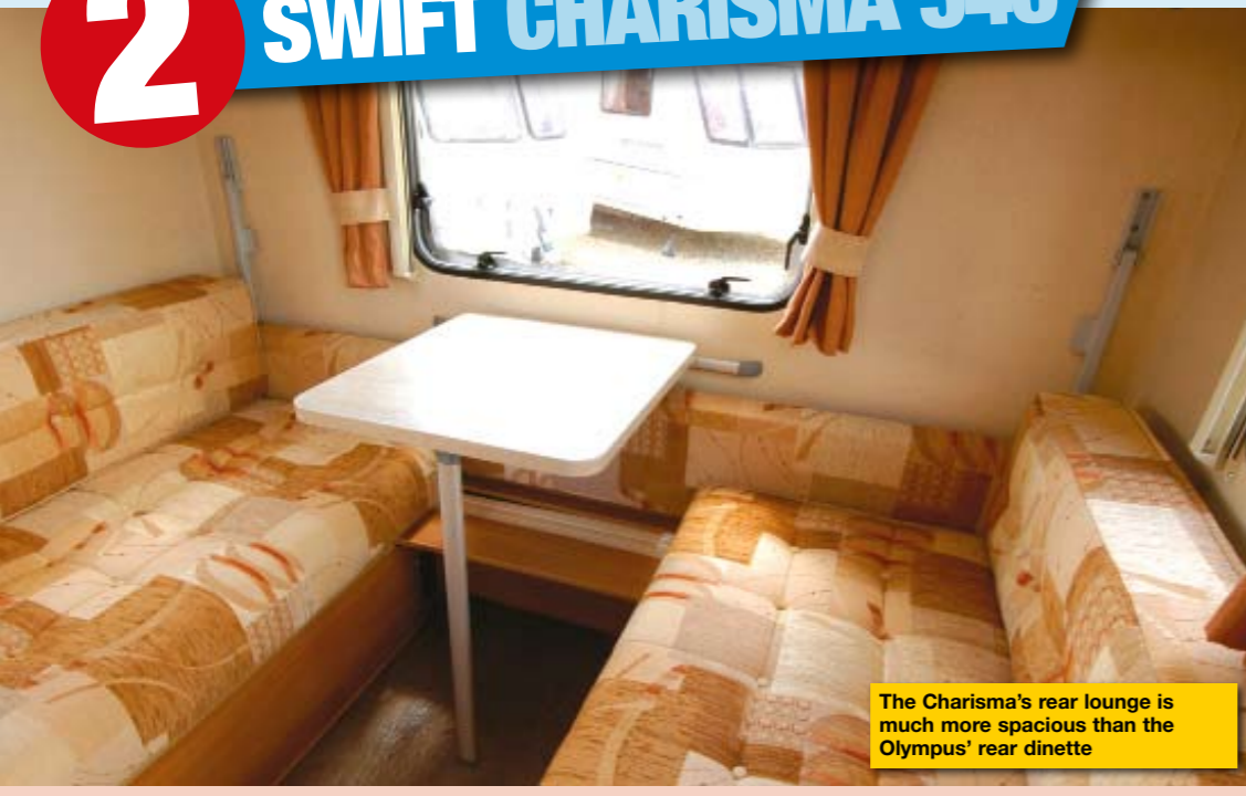
The Charisma's rear lounge is much more spacious than the Olympus' rear dinette