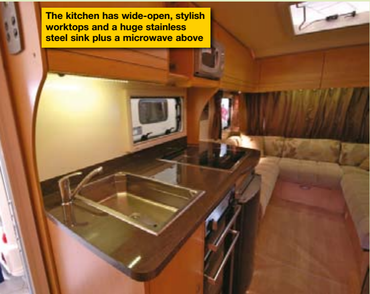
The kitchen has wide-open, stylish worktops and a huge stainless steel sink plus a microwave above