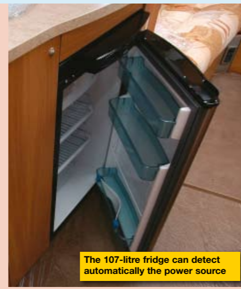
The 107-litre fridge can detect automatically the power source