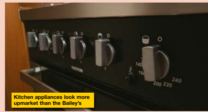
Kitchen appliances look more upmarket than the Bailey's