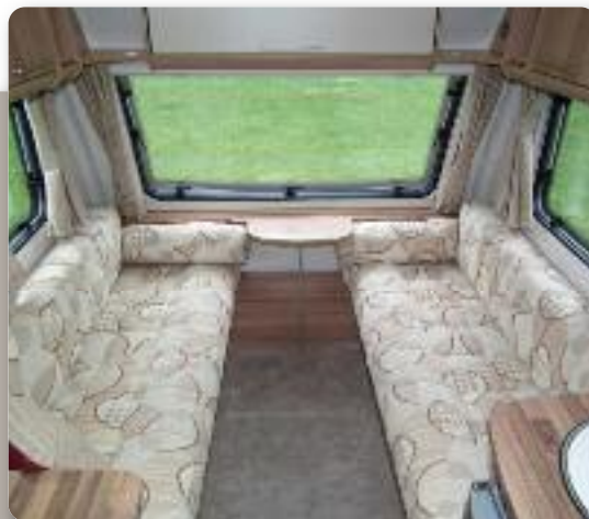
Sofas are a decent length and the upholstery is supportive

The double bed is terrific – it is not only quickly made up by sweetly-gliding slats, >>