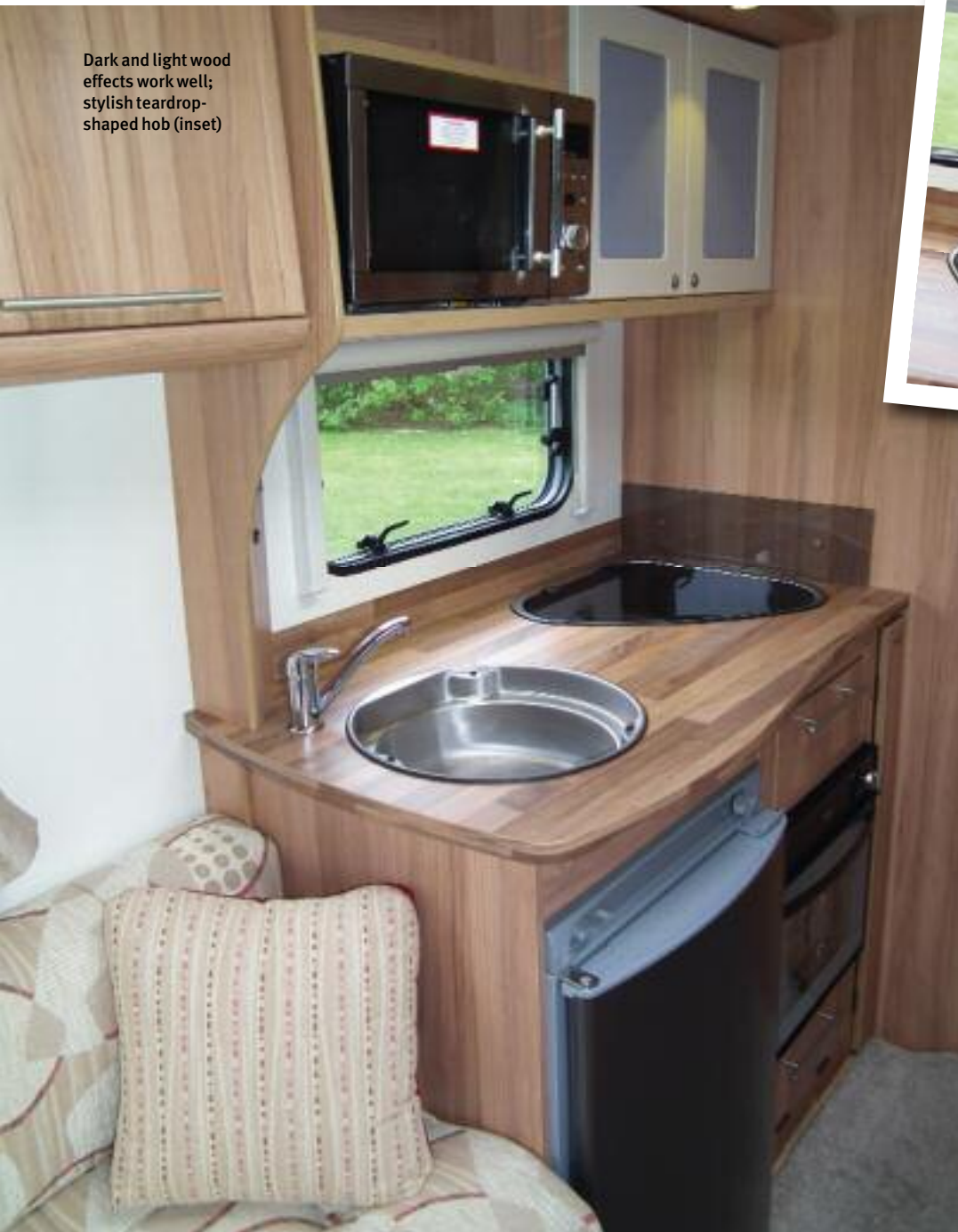
Dark and light wood effects work well; stylish teardrop-shaped hob (inset)