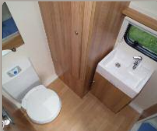
The Belfast-style sink in the end washroom is a nice touch

“The double bed is terrific – almost unfairly large for its occupants”