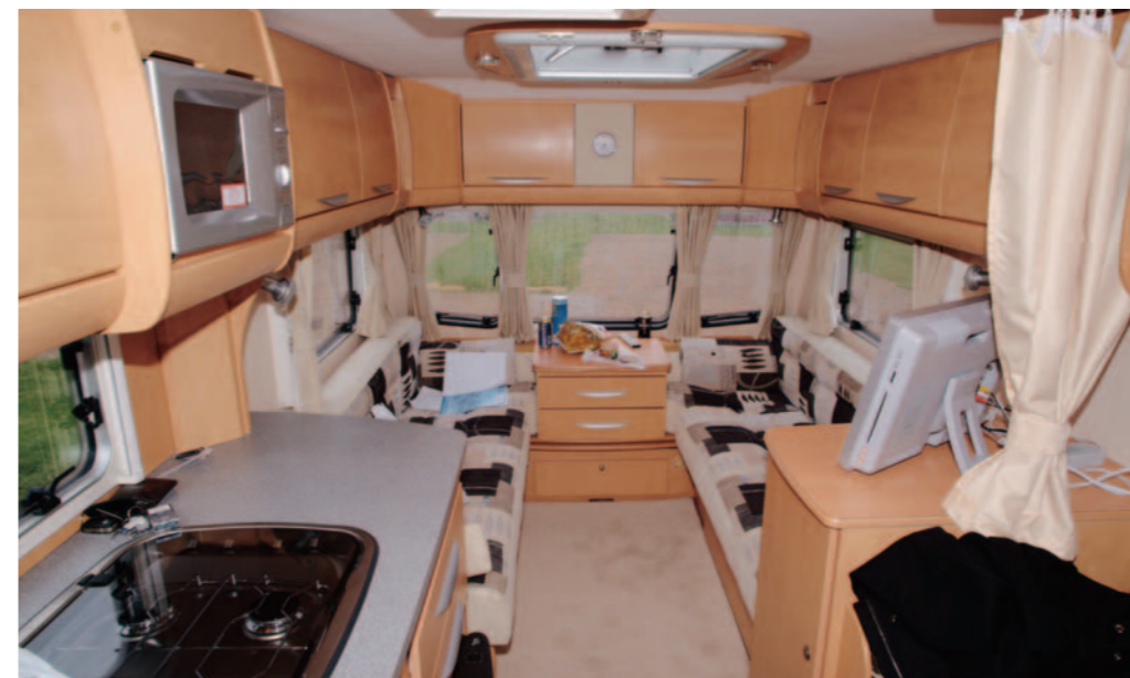
There's an impressive amount of natural daylight in this Arizona.

Last up is the kitchen. Possibly the best aspect of the Arizona's kitchen is the large upright cupboard opposite the sink, oven and hob that has a fantastic slide-out metal storage rack - perfect for your tins and packet food. The kitchen area itself comprises a