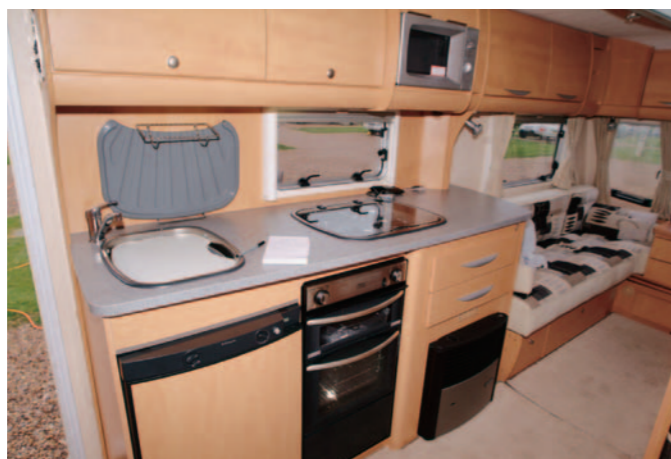
Kitchen comes with new Dometic 115-litre fridge.