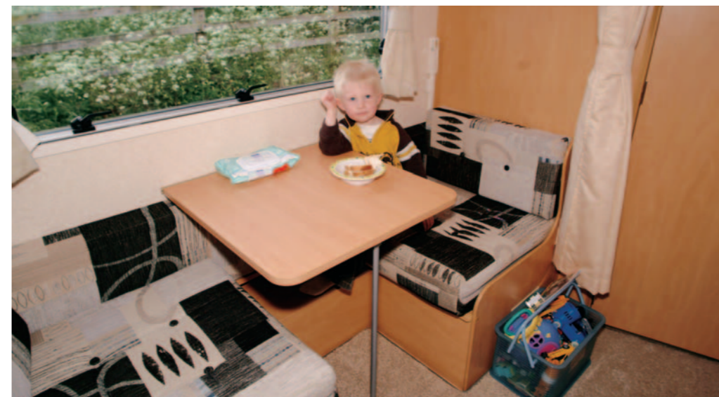
Nifty cushion set-up makes it easy to convert the dinette to twin bunks.

Stepping in, I was impressed with its look and feel - lots of light as well as a good-sized,