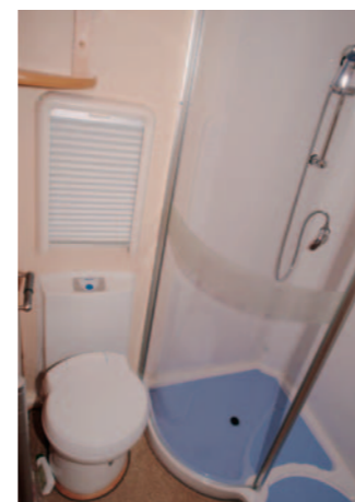
Fantastic walk-in shower.