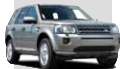
FREELANDER 2 1785KG