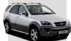
KIA SORENTO 2067KG