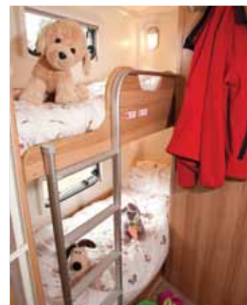
Bunks, storage beneath – and plenty of coat hooks in this kids' bed area