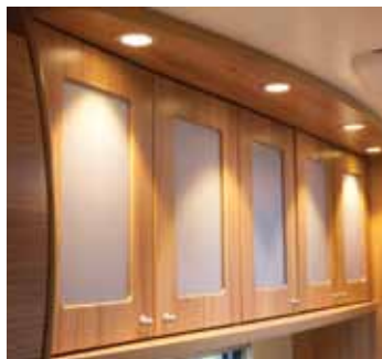
Spotlights above and below these lockers give excellent illumination on the kitchen surface

Bailey's Alu-Tech construction isn't all about being wood-free and