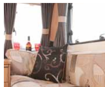
Big, bold splashes of black in the form of cushions ensure the overall look is eye-catching