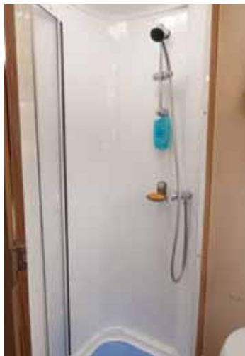
Practical and spacious, the shower area is an unusual shape to give good floor space