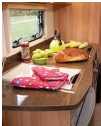
The big, rectangular sink has a chopping-board cover that's level with the kitchen surface

having a 10-year anti-water ingress guarantee. It's about the design of the front locker arrangement too. Gas is housed on its own, centre-front, in a locker that's not designed to provide room for much else. On each side of the caravan, doors open to reveal large hatches for the other items you'd store in exterior lockers. Spending quality time in a succession of Alu-Tech models has taught us that this triple locker arrangement works much better than anything one full-width locker can offer. That's because, in three smaller lockers, stuff doesn't fall over and get into a jumble every time you tow. We find you can get much more organised over what goes where – and it stays there.