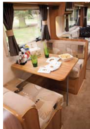
The side dining area is just about wide enough for four little children to sit to eat or play