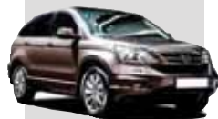
HONDA CRV 1890KG