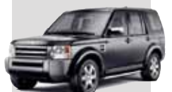
LAND ROVER 2230KG