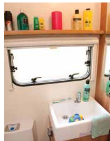
A deep, rectangular Belfast-style washbasin with cupboard beneath