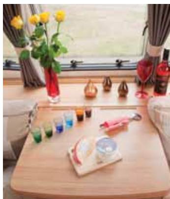
All Olympus models have this deep window sill; the table-top drawers unit is an option