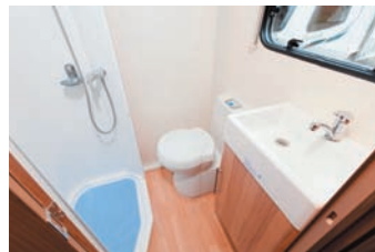
Families will appreciate the Bailey's large nearside-corner washroom

The restyled lounge is a major improvement over the original Olympus' sterile living space. The walnut cabinetwork and 'Panama' soft furnishings combine well,