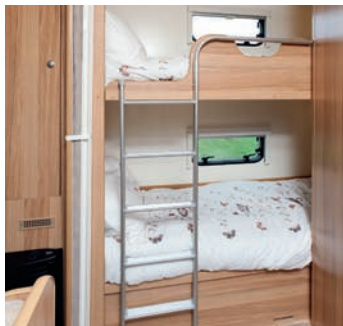
The fixed bunks are solidly built and the ladder is snugly fitted

Manufacturer Bailey of Bristol Address South Liberty Lane, Bristol BS3 2SS Tel 0117 305 2939 Web www.baileyolympus-s2.co.uk Dealers 80