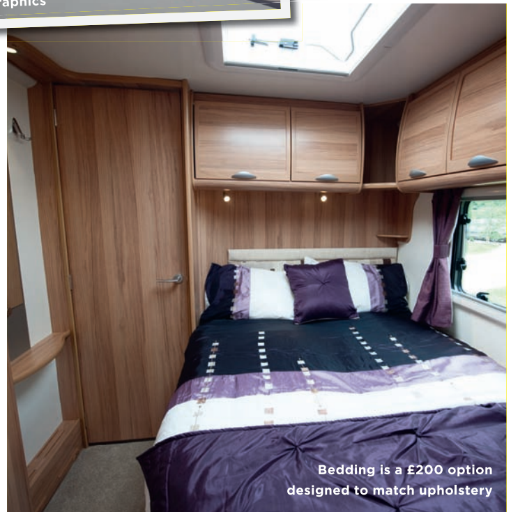
Bedding is a £200 option designed to match upholstery