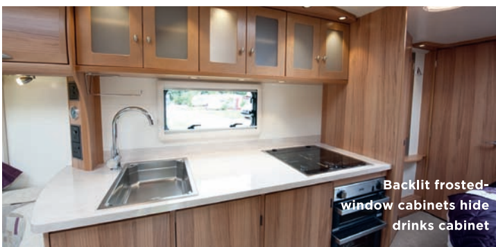
Backlit frosted-window cabinets hide drinks cabinet