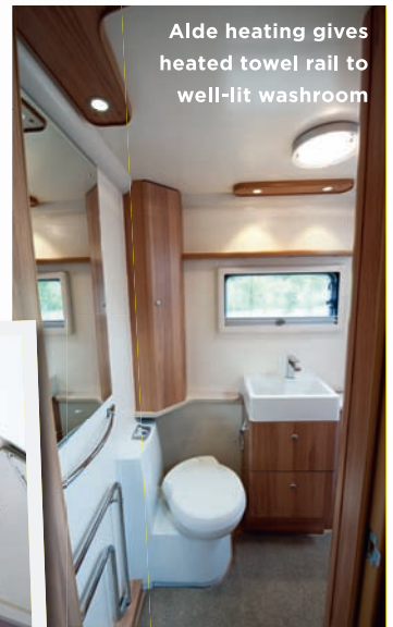
Alde heating gives heated towel rail to well-lit washroom