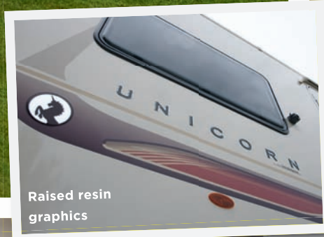
Raised resin graphics