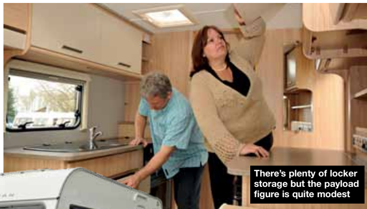
There's plenty of locker storage but the payload figure is quite modest