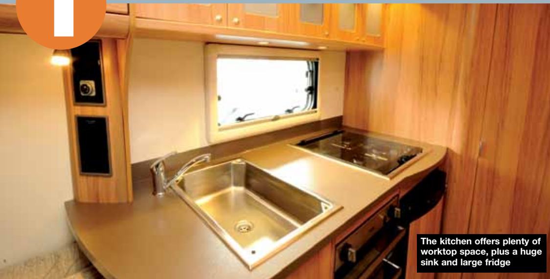
The kitchen offers plenty of worktop space, plus a huge sink and large fridge