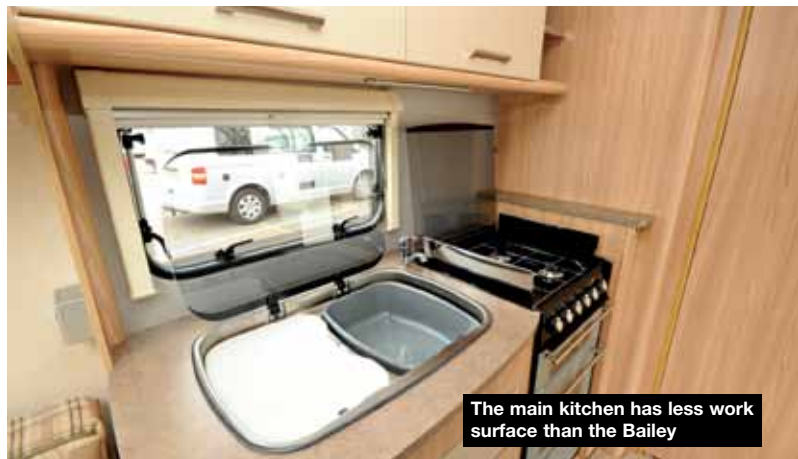
The main kitchen has less work surface than the Bailey