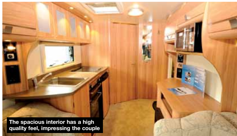
The spacious interior has a high quality feel, impressing the couple