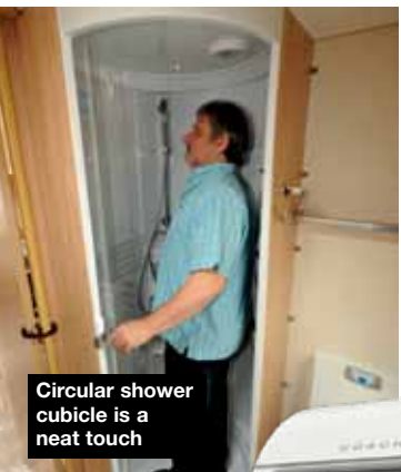
Circular shower cubicle is a neat touch

Narrow body, relatively low payload figure