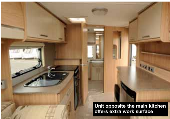
Unit opposite the main kitchen offers extra work surface