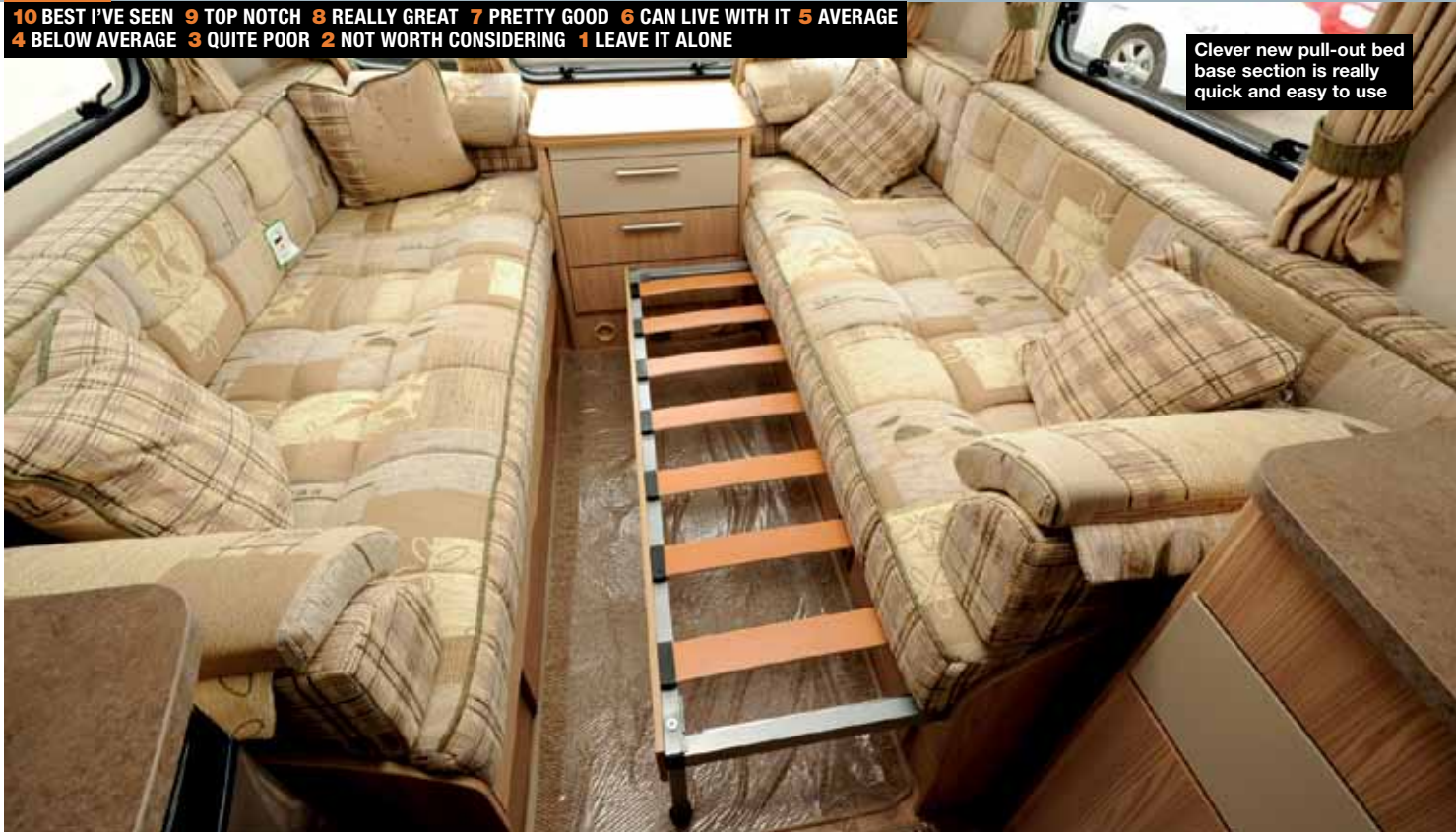
Clever new pull-out bed base section is really quick and easy to use

10 BEST I'VE SEEN 9 TOP NOTCH 8 REALLY GREAT 7 PRETTY GOOD 6 CAN LIVE WITH IT 5 AVERAGE 4 BELOW AVERAGE 3 QUITE POOR 2 NOT WORTH CONSIDERING 1 LEAVE IT ALONE