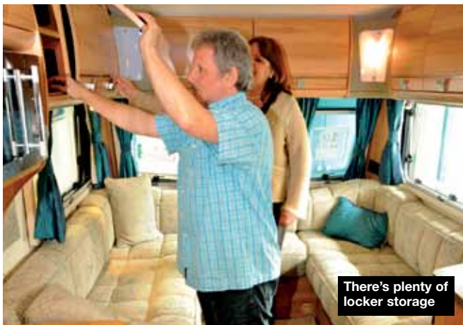
There's plenty of locker storage