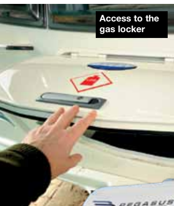
Access to the gas locker